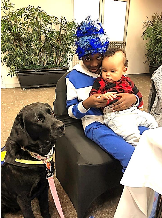
Changeover special guests

BBQ at Bunnings: a new Rotary year sees a new list of volunteers.