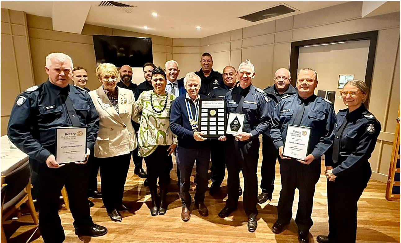
The Team 2024